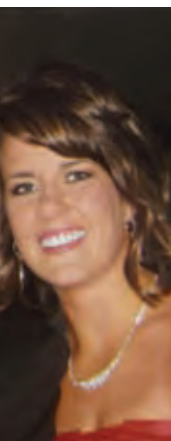
arrive at Seminar in a limo.